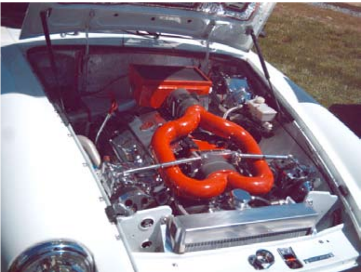
Check out the Turbo Horses!