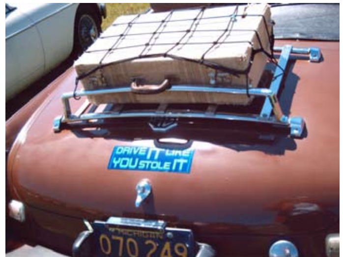
Entry from Michigan Drive IT Like YOU stole IT!