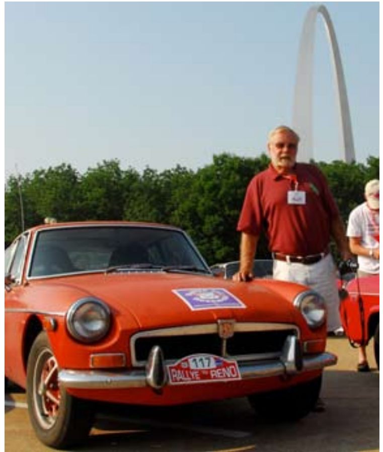
On June 7th cars positioned their cars in the parking lot near the Arch for a photo taken from a helicopter.

On Thursday, June 2nd the caravan started the trip north though Georgia, South Carolina and into North Carolina. Early June 3rd they arrived in Ocean City, Maryland meeting up MG owners participating in the Rallye to Reno. On June 4th the cars started the 3,073 mile trek to California. The first day they traveled through Maryland, Washington DC and Virginia. With an early start on June 5th they made it through West Virginia, Ohio and Kentucky. On June 6th they crossed into Indiana and by midday they were in St. Louis, Illinois.